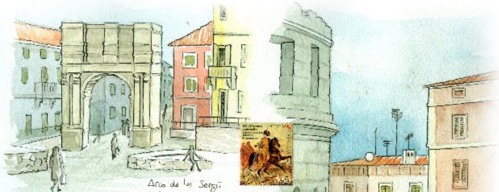
Arco de los Sergii s.lac