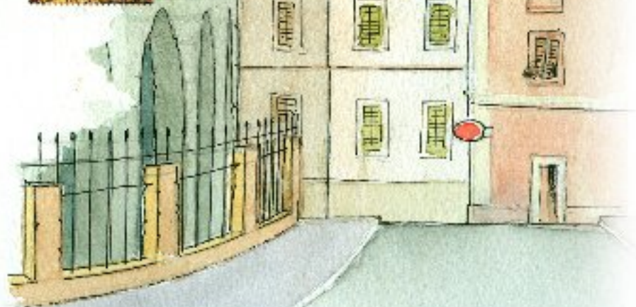
Amfiteatro de Pula