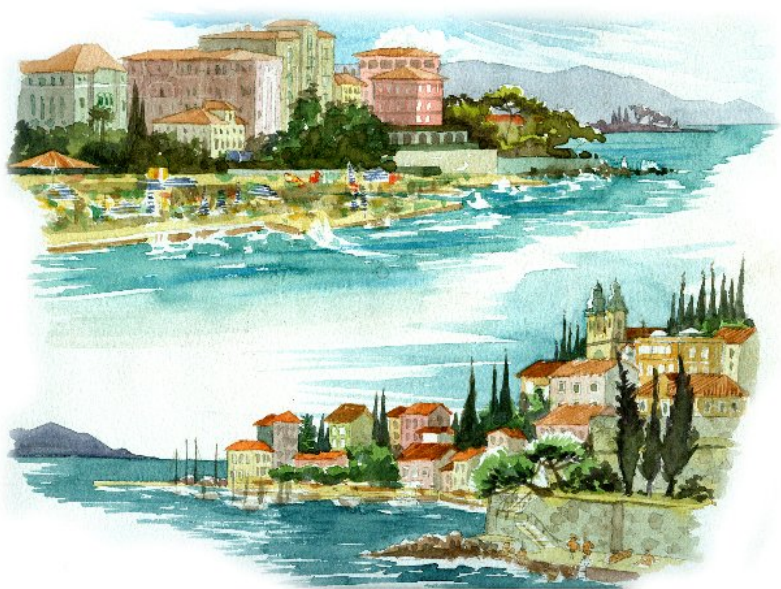
Opatija and Volosko