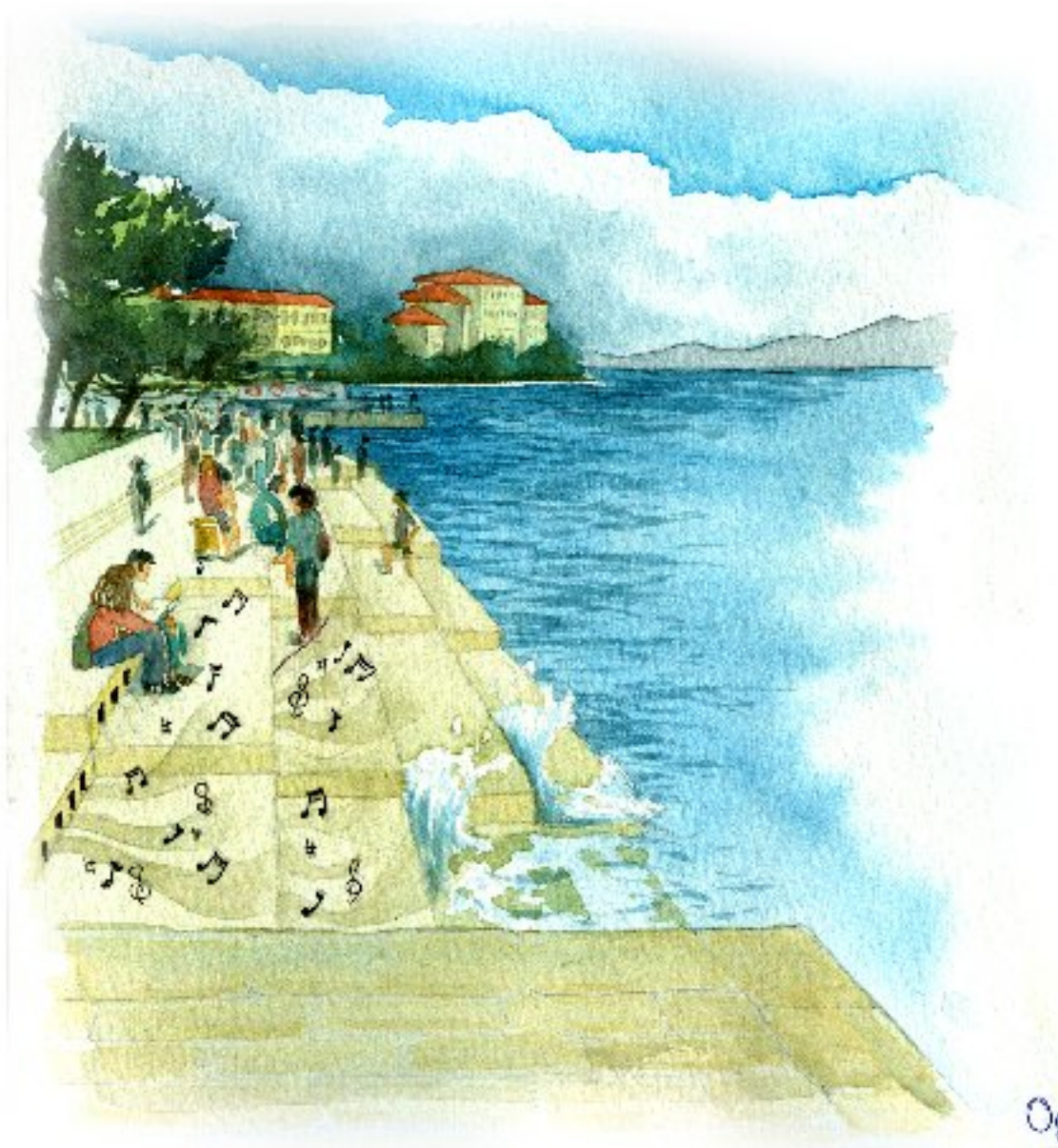
Organo marino de Zadar