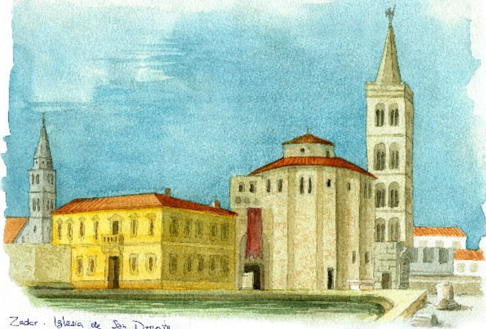
Zadar . Iglesia de San Donato